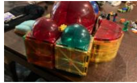
THE TROOP TRANSPORT/PRISON MOVES THROUGH THE BATTLEFIELD