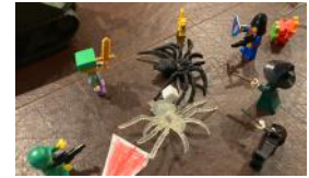
ARACHNIDA AND ANOTHER SPIDER UNDER HEAVY ATTACK