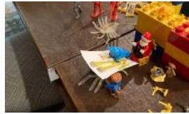
SANTA CLAUS AND OTHER TROOPS COMBAT A SPIDER AND ZURG ROBOT