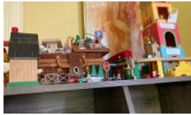
BINGO RECENTLY UNDER ATTACK BY ZURG COMMAND SHIP